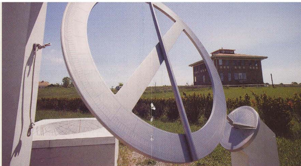
An instrument at the observatory, where you can view the universe as ancient people once did.

To tour the 160-acre Maharishi Vedic City Organic Farm, drive six miles north to 140th Street. Inside the vast 1.2-acre certified organic greenhouse, plots of rainbow chard, red-leaf lettuce, fennel and other vegetables carpet the floor like a vast patchwork quilt. In June, the greenhouse celebrated its first year of production, and was able to distribute its products to markets in Des Moines, Iowa City and even Chicago.