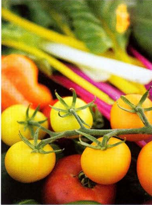
Organic vegetables from the Maharishi Vedic City Agricultural Greenhouse.

are calculated to create a harmonious relationship between the homeowner and the sun, moon and planets. Like the fence styles, the home's physical architectural styles vary widely, from Victorian revival to classical to modern. The Vedic tradition is evident in the placement of rooms, their dimensions, the slope and shape of the land and the location of bodies of water.